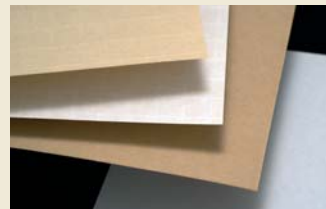
Technical industrial papers

Walki Group P.O.Box 40 FI-37601 Valkeakoski, Finland Tel +358 (0)205 36 3111 Fax +358 (0)205 36 3090