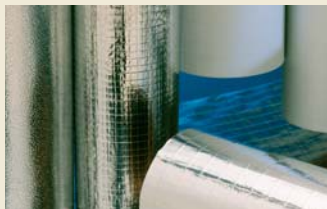
Insulation and construction facing materials